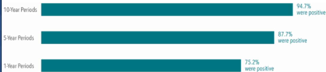
Exhibit 2. Frequency of Positive Returns in the S&P 500 Index Overlapping Periods: 1926–2018

In US dollars. From January 1926–December 2018, there are 997 overlapping 10-year periods, 1,057 overlapping 5-year periods, and 1,105 overlapping 1-year periods. The first period starts in January 1926, the second period starts in February 1926, the third in March 1926, and so on. S&P data © S&P Dow Jones Indices LLC, a division of S&P Global. Indices are not available for direct investment. Index returns are not representative of actual portfolios and do not reflect costs and fees associated with an actual investment. Past performance is no guarantee of future results. Actual returns may be lower.